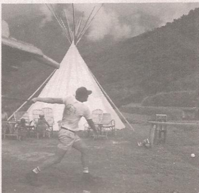
THERE SHE GOES...