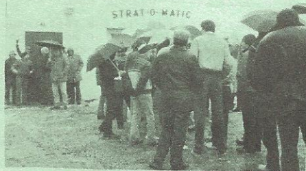
LONG LINE OF CUSTOMERS BRAVES ELEMENTS, WAITS FOR DOORS TO OPEN