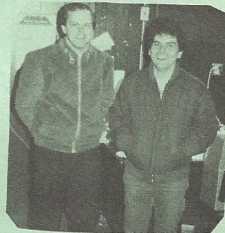
TWO GAMERS FROM MONTREAL